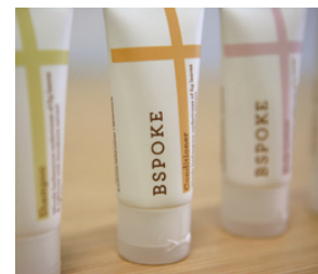
Bspoke Bathroom Amenities