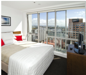
1 brm Deluxe Harbour View

Plug in your MP3 or iPod, cook up a storm or order in a Roomrunner meal and enjoy a sensational sunset from a Harbour view suite showcasing the Waitakere Ranges across to the Harbour Bridge and Westhaven. Alternatively drift off to sleep before the big day ahead under the twinkle of the CBD lights in one of our super-comfy beds.