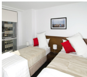
Twin brm configuration

For stays over seven days, suites can be serviced weekly or more frequently for an additional charge. The ideal residence for corporate relocations, talk to us about special rates for your longstay accommodation requirements.