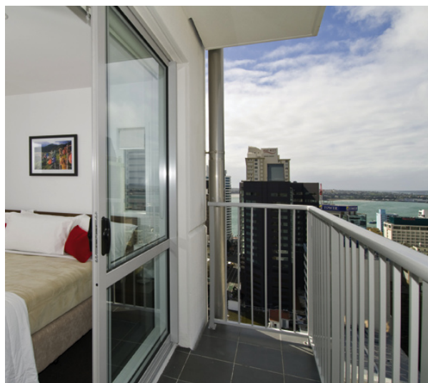
2 brm Deluxe

We've thought of everything for your stay - flat screen TVs, SKY TV, high speed broadband access, stereo, full kitchen and laundry facilities, and 24 hour guest reception with secure keycard access. Enjoy our custom made NZ botanical range of bathroom amenities and keep up your fitness regime with complimentary access to the nearby 151 Corporate Gym including a 25m lap pool & tennis court (health & beauty services available at an additional cost).