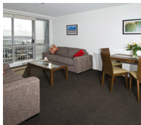
1 brm Deluxe Harbour View